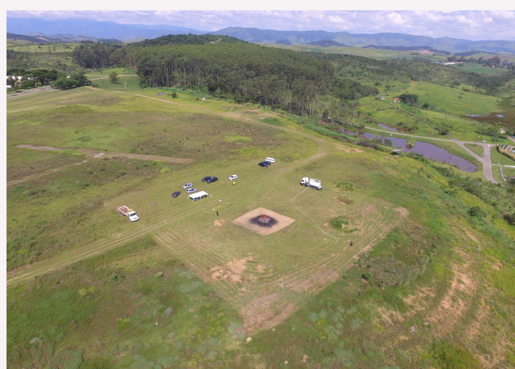
Figure 1: (a) View of experimental plot located at the INPE facility in Cachoeira Paulista-SP/Brazil (44.999°W 22.686°S); (b-c) atmospheric profiles derived from radiosonde and MERRA-2 reanalysis data on 05 July 2017 to correct near-coincident S-NPP/VIIRS fire pixel radiances.

We deployed a custom-made broadband spectral radiometer along with a commercial off-the-shelf infrared cameras (e.g., FLIR VueProR, Zenmuse XT) mounted to small consumer drones (e.g., DJI's Phantom series) flown over small prescribed burns implemented so as to coincide with the overpass times of different Earth observing satellites (e.g., NASA Terra & Aqua, NOAA/NASA S-NPP, USGS Landsat-8, and ESA Sentinel-2). Near-simultaneous fire radiative power (FRP) retrievals were obtained using the airborne and spaceborne data acquired during prescribed fires conducted in grasslands and savannas plots in the Brazilian states of Rio de Janeiro, Tocantins and Mato Grosso do Sul between July 2017 and September 2018. A set of standard operating procedures were defined with attention to satellite active fire data validation requirements (e.g., reference data calibration) and subsequently adopted for each of the fires sampled. Airborne and spaceborne observations were co-located and temporally paired to within 2sec, and path transmittances calculated in order to account for atmospheric attenuation of fire retrievals.