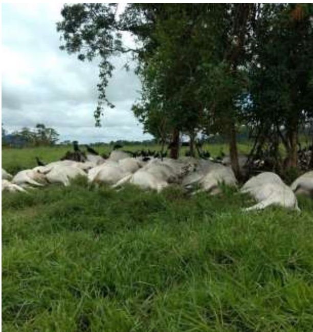
Figure 1 - Cattle killed by lightning under a tree in Rondônia on March 16, 2018.

The highest number of cattle deaths in one event was 103 in Cacoal, Rondônia, on March 16, 2018 (Figure 1). The cattle were under a tree, which is the most common circumstance of death. As far as we know, this is the highest number of cattle deaths in one event already reported worldwide. In the media we found 68 cattle deaths after a lightning strike in New South Wales, Australia ( https://www.northernstar.com.au/news/apn-flash-of-lightning-kills-68-dairy/17327 ) in 2005 and 52 cattle deaths after a lightning strike in Uruguay in 2008 ( https://en.mercopress.com/2008/10/24/lightning-kills-52-cattle-during-storm-in-uruguayan-farm ). The largest known number of animals reported as being killed by a lightning event was 320 sheep in Scotland in 1748 [9]. In comparison, the largest number of human reported being killed directly by a lightning strike was 21 in Rhodesia (now named Zimbabwe) in 1975 [10].